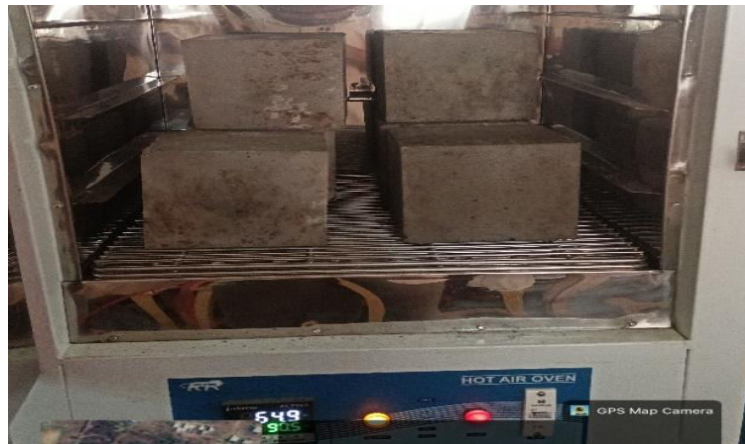
Fig 4 Heat Curing in Oven (90°C)

(A Monthly, Peer Reviewed, Refereed, Scholarly Indexed, Open Access Journal)